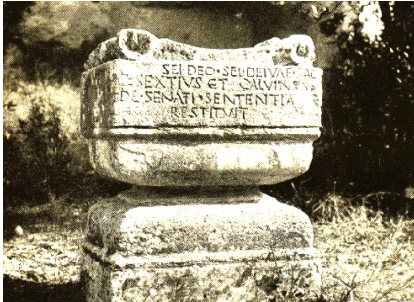
Altar to "the Unknown God" - Rome, 100BC -